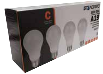
A19 4 pack