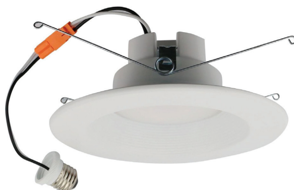
5" - 6"