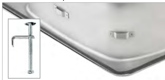
Inset: Hold down

Off-the-Bowl clips for ease of installation.