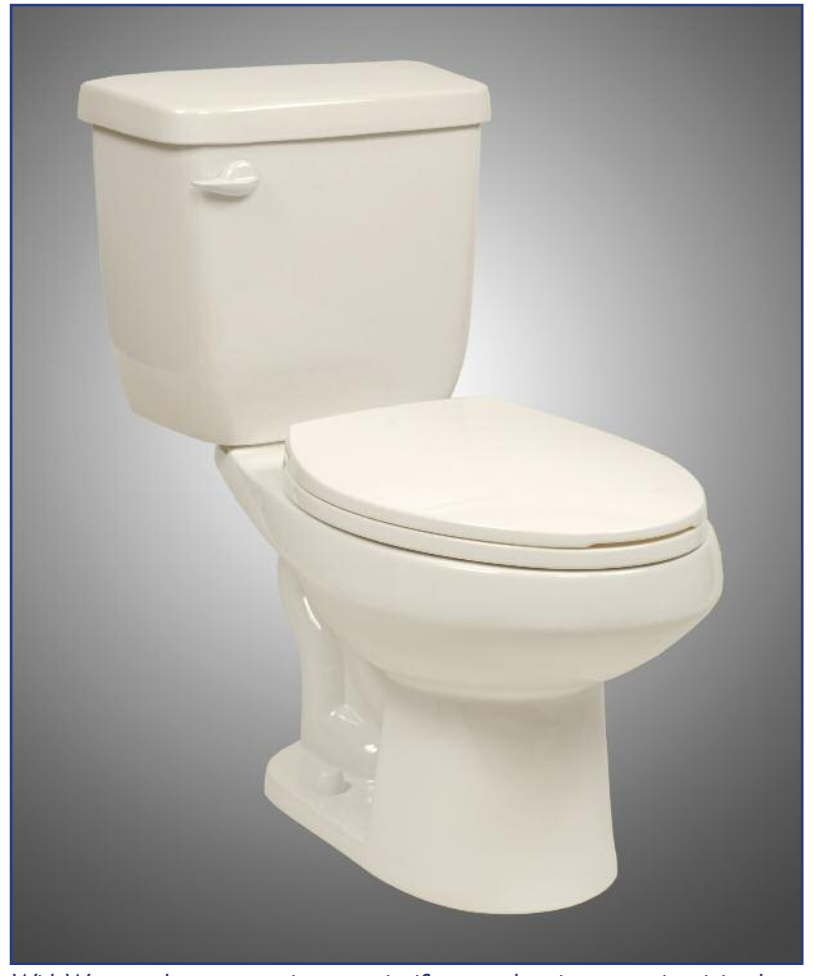
With Western the water savings are significant and maintenance is minimal.