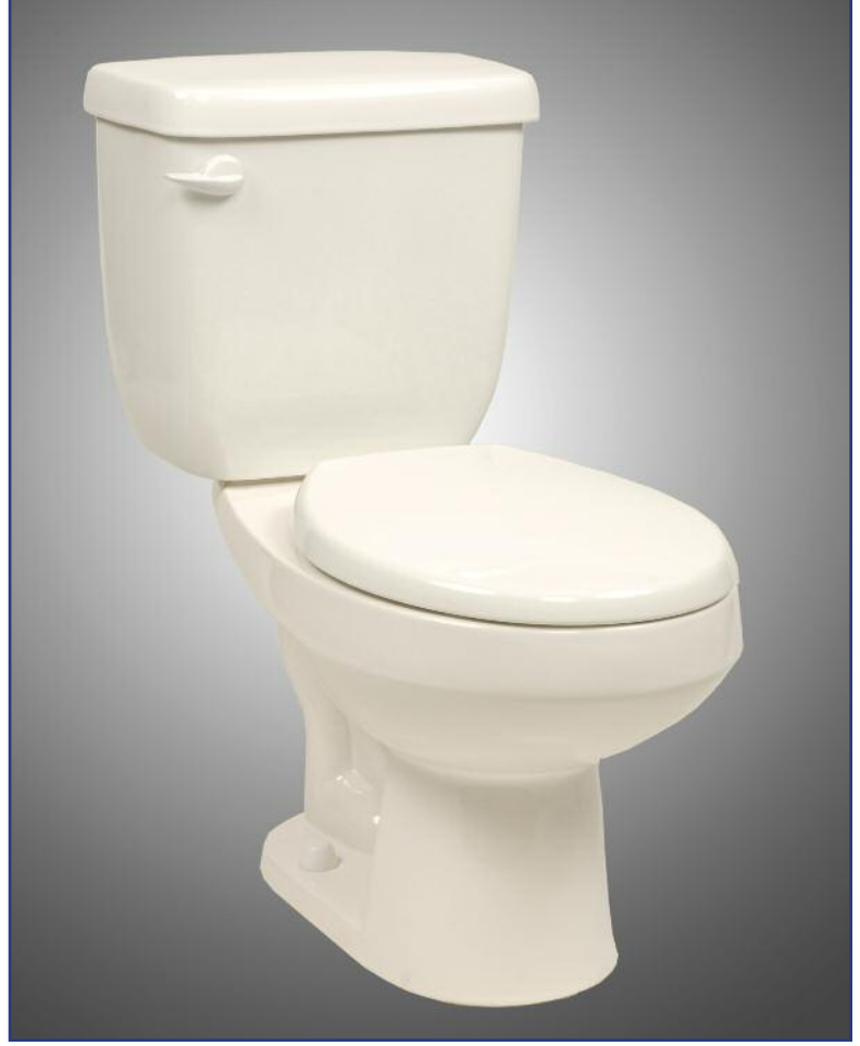
With Western the water savings are significant and maintenance is minimal.