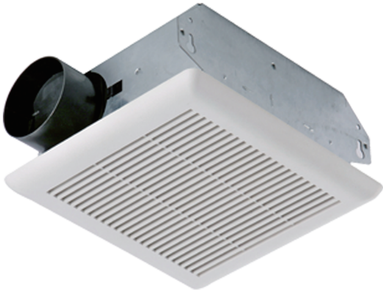
Optional Fluorescent Light