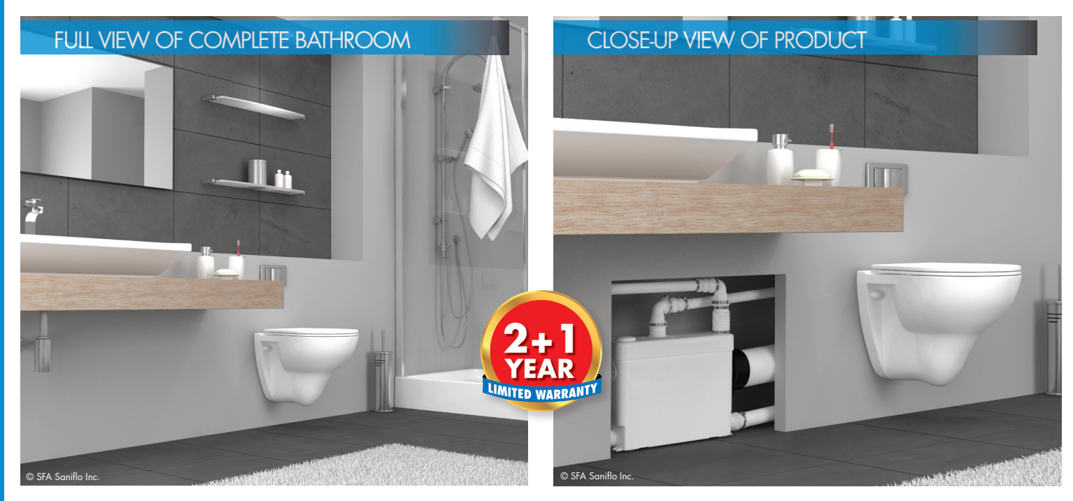
The Sanipack is a 1/2 HP pump system used to install a complete bathroom up to 15 feet below the sewer line, or even up to 150 feet away from a soil stack. It incorporates a macerating system which can handle human waste and toilet paper in residential applications. The blade is made out of a hardened stainless steel material which eliminates the need for any service or replacement.