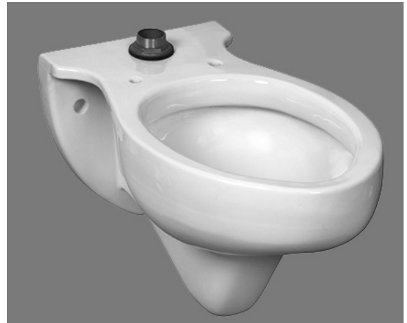
3445J.101 Rapidway 3-Bolt Top Spud