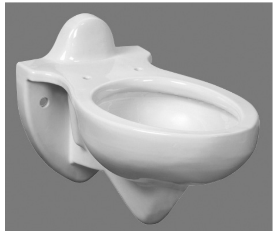
3445L.101 Rapidway 3-Bolt Back Spud