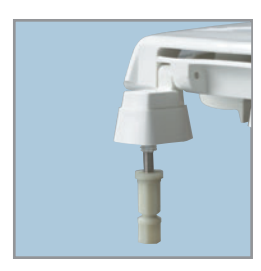
STA-TITE® COMMERCIAL FASTENING SYSTEM™