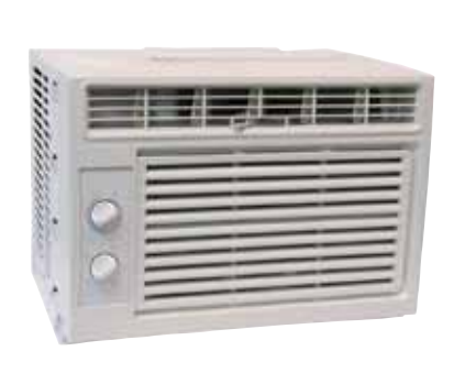
Visit us online at www.comfort-aire.com